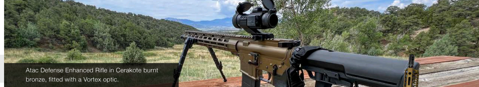
Atac Defense Enhanced Rifle in Cerakote burnt bronze, fitted with a Vortex optic.